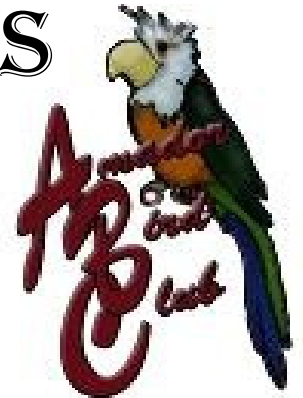
“home of the rare Amadorian Combo Parrot”