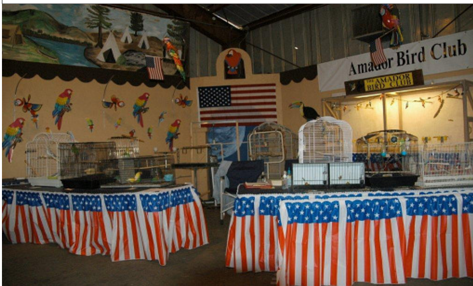
2012 ABC County Fair Booth

Each year the bird club sponsors a booth at the Amador county fair, featuring a variety of birds provided by our members for the enjoyment of fairgoers and to promote membership in our club. The booth is managed by our members from 9am to 9pm for each of the four days of the fair (see schedule below). "Booth hosting" is a wonderful way to share our love of birds with the public and to enjoy the fair at the same time! Volunteers receive free admission to the fair, courtesy of ABC; no experience is necessary. Each day is split into morning (9am-3pm) and evening (3pm-9pm) shifts, and each shift is covered by two members, so it's easy to enjoy the fair without leaving the booth unattended. The birds in the booth also make for charming company, and they need to have "birdy-sitters" to ensure their well-being. Slots for "booth nesting" are filled as members volunteer: there may be some slots left, so please check the table on the next page for remaining open slots and pick one that works for you!